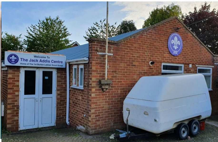
The Jack Addis Centre, Burton Latimer