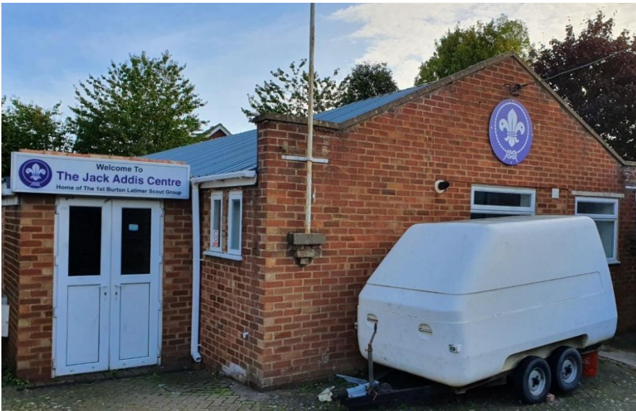
The Jack Addis Centre, Burton Latimer