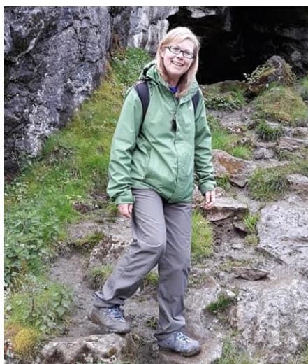
Leadership Team, Falcon Pack

Day: Wednesday Time: 6.30pm - 8.00pm Place: The Jack Addis Centre, Higham Road, Burton Latimer Email: falconcubpack@aol.com