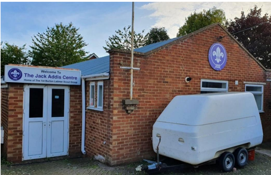
The Jack Addis Centre, Burton Latimer