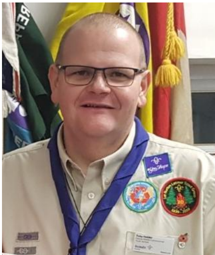
Leadership Team, Eagle Pack