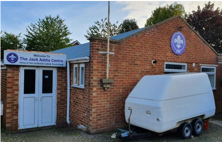
The Jack Addis Centre, Burton Latimer