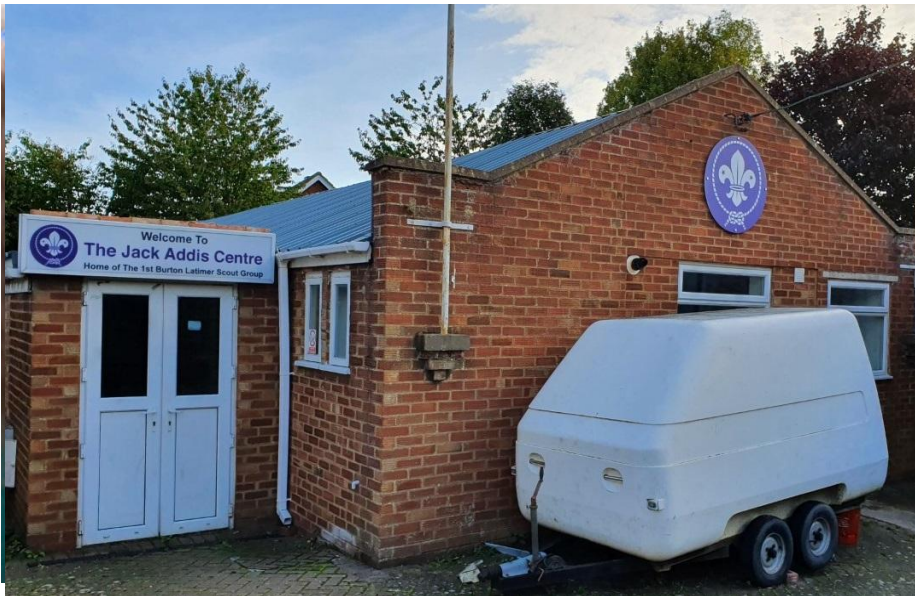
The Jack Addis Centre, Burton Latimer