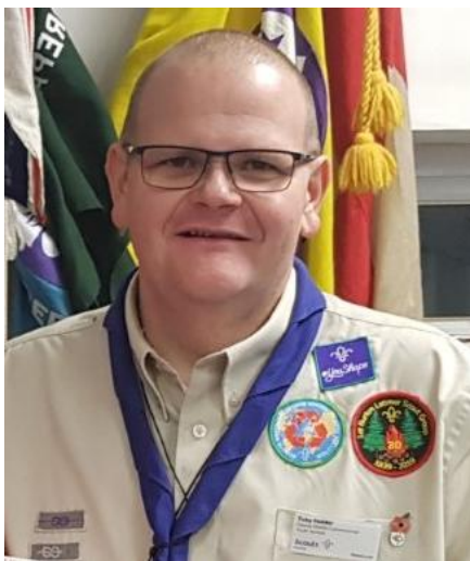
Leadership Team, Eagle Pack